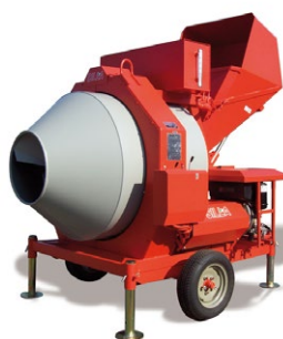
Concrete Mixers (Diesel/Electric)