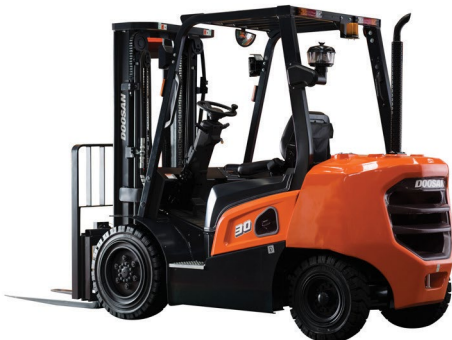
Light Duty Forklift – Diesel/LPG