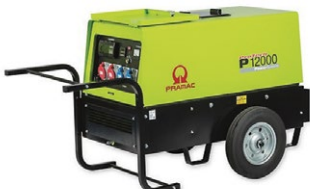
Portable Generators (Diesel & Petrol)