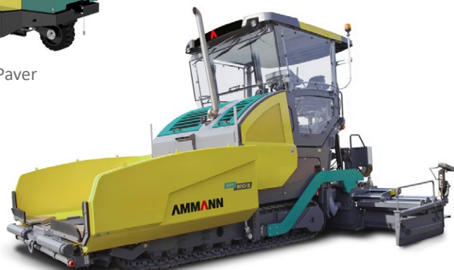
Asphalt Paver - Tracked