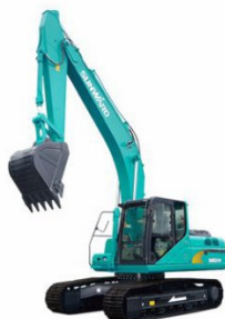
Heavy Tracked Excavator