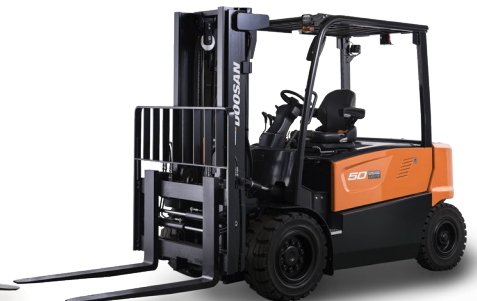
4 Wheels Electric Forklift