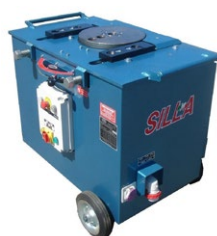
Steel Bar & Bender