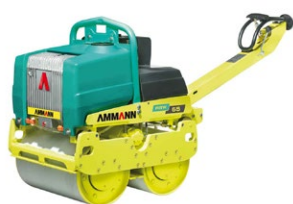
Walk Behind Roller