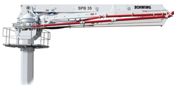
Separate Placing Boom