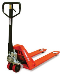
Hand Pallet Truck