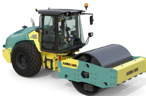
Single Drum Compactor