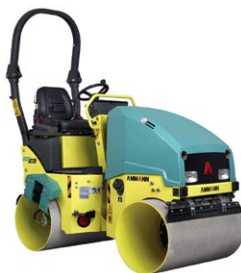
Light Tandem Roller