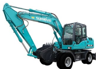
Heavy Wheeled Excavator