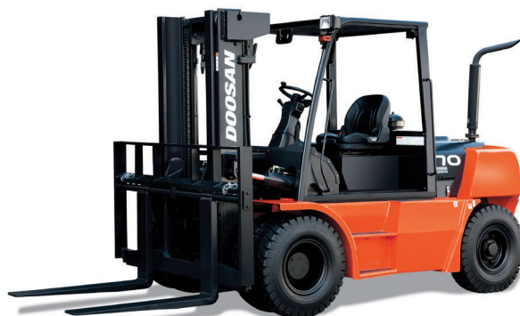
Heavy Duty Forklift – Diesel/LPG