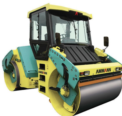
Double Drum Compactor