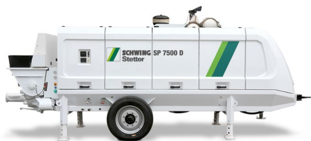
Stationary Concrete Pump