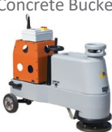
Tile Polishing Machine