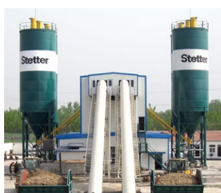
Stationary Batching Plant