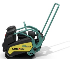
Forward/ Reversible Plate Compactor