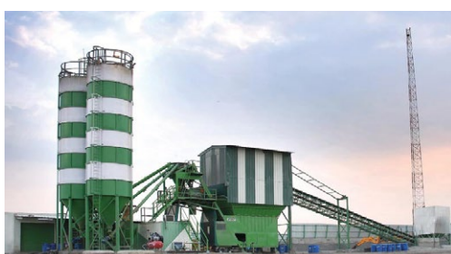
Mobile Batching Plant