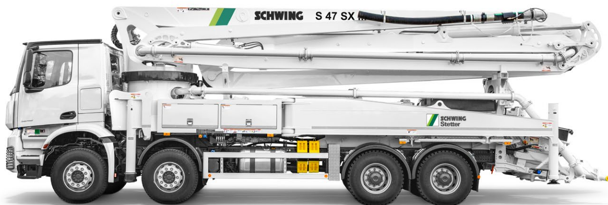
Truck Mounted Concrete Pump