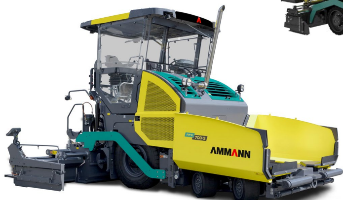
Asphalt Paver - Wheeled