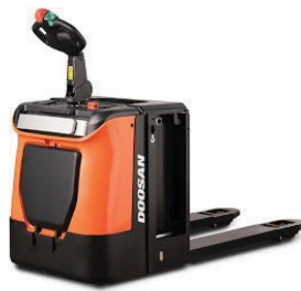
Electric Platform Pallet Truck