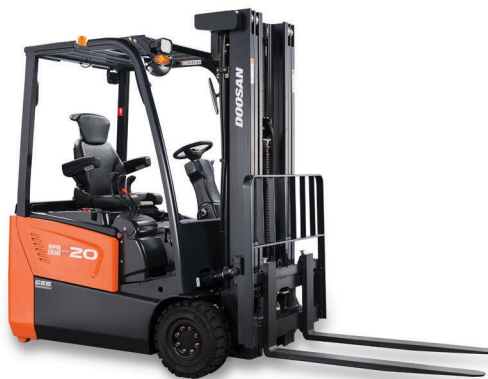
3 Wheels Electric Forklift