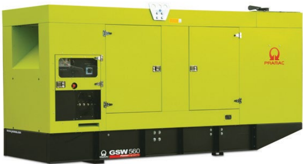
Diesel Generators(Prime & Standby)