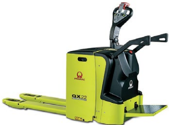
Electric Platform Pallet