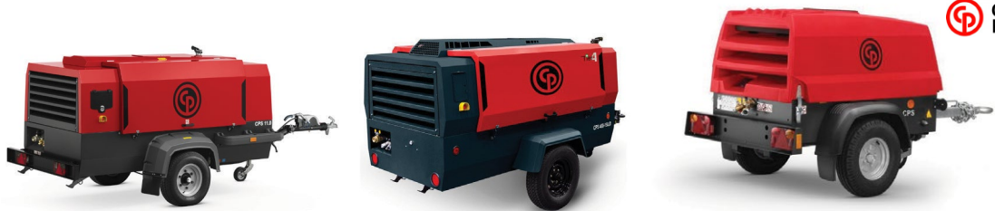
Complete range of Compressors