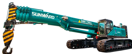
Telescopic crawler crane