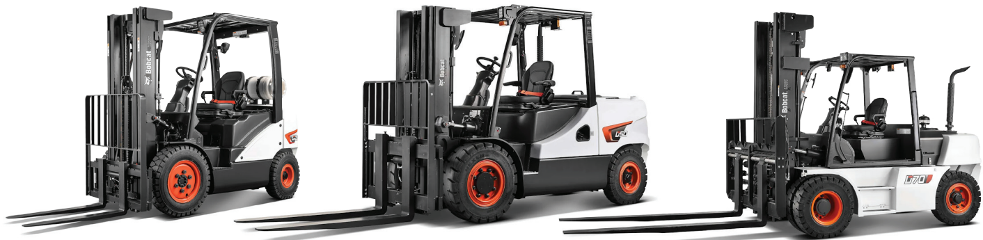
Light Duty Forklift – Diesel/LPG