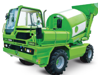
Concrete Mixer DBM 3500