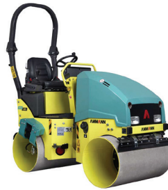
Light Tandem Roller