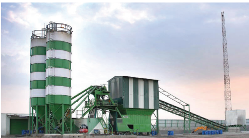
Mobile Batching Plant