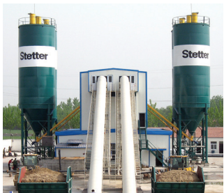
Stationary Batching Plant