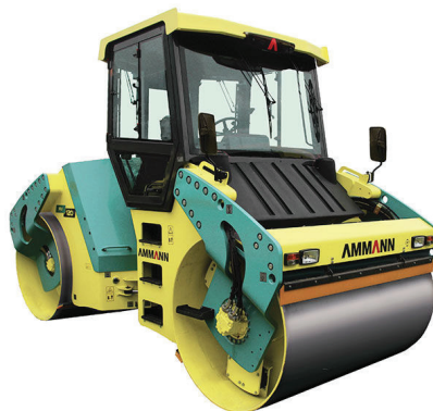
Double Drum Compactor