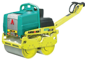
Walk Behind Roller