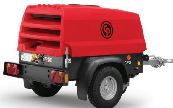
Complete range of Compressors