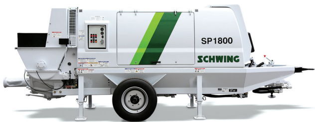
Stationary Concrete Pump