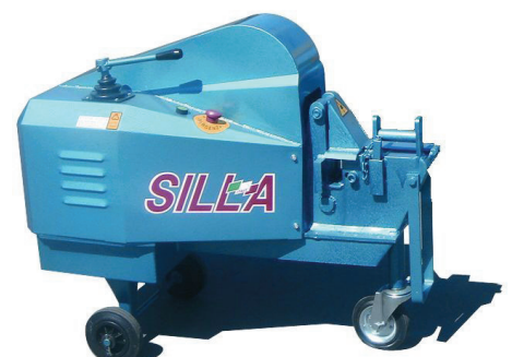
Steel Bar Cutters & Benders