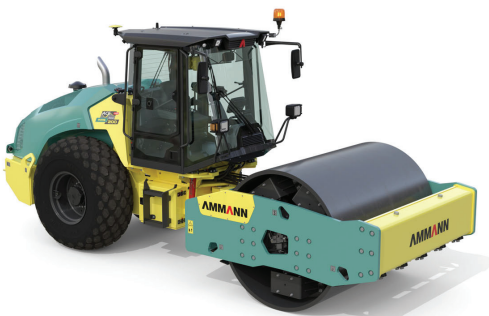
Single Drum Compactor