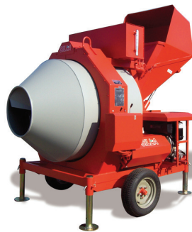
Concrete Mixers (Diesel/Electric)