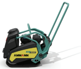
Forward/ Reversible Plate Compactor