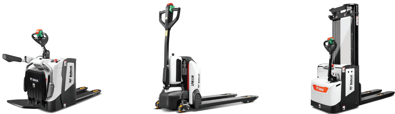
Electric - Pallet Truck/Stacker