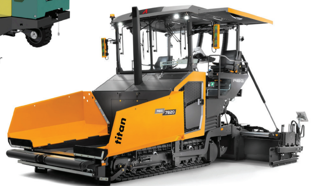
Asphalt Paver - Tracked