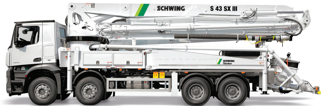
Truck Mounted Concrete Pump