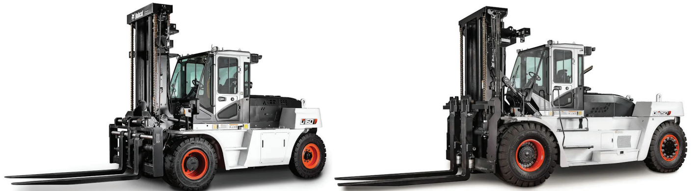
Heavy Duty Forklift – Diesel/LPG